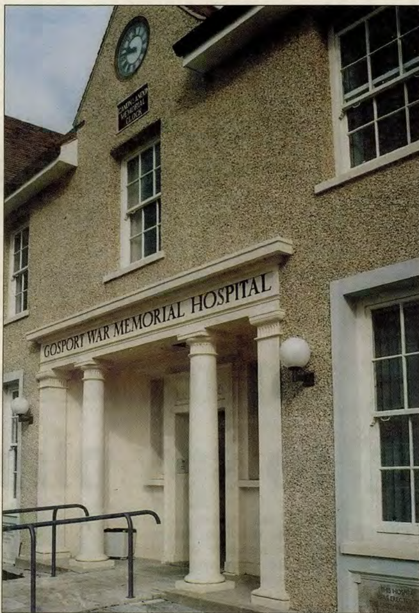
The War Memorial Hospital, Gosport, is at the centre of a police probe