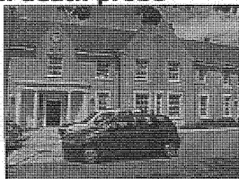
Government inspectors strongly criticised the hospital in 2002

The second investigation has seen files passed to the Crown Prosecution Service.